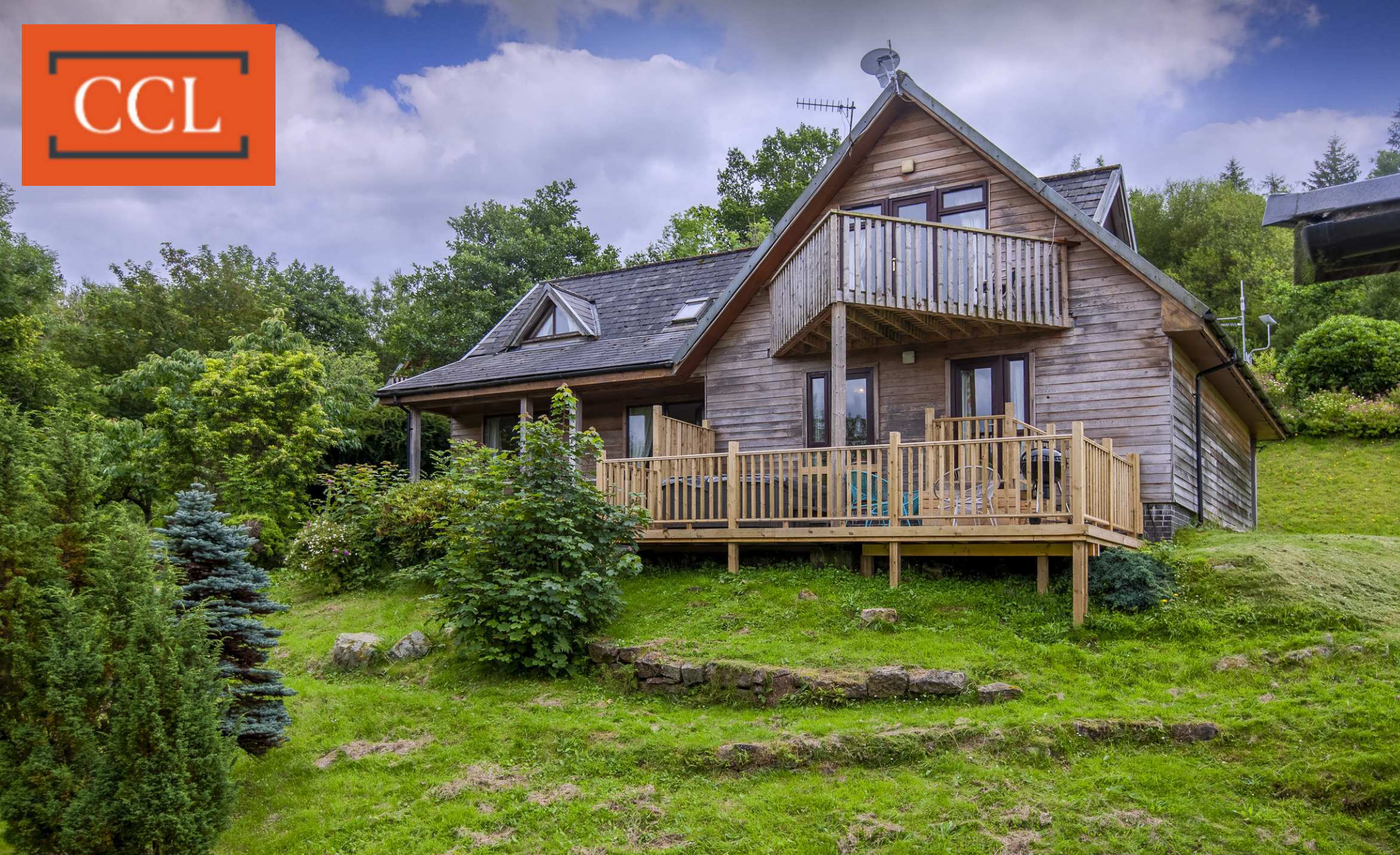
2 Bed Portsonachan Lodges, Portsonachan, Dalmally, Argyll and Bute