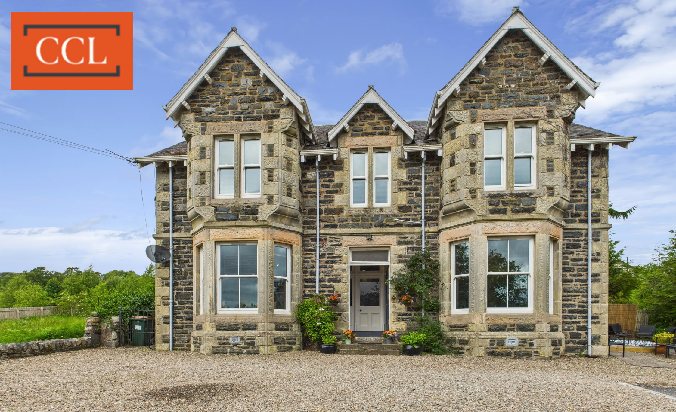
Kinnaird House and Garden Cottage , Kirkmichael Road, Pitlochry, Perthshire