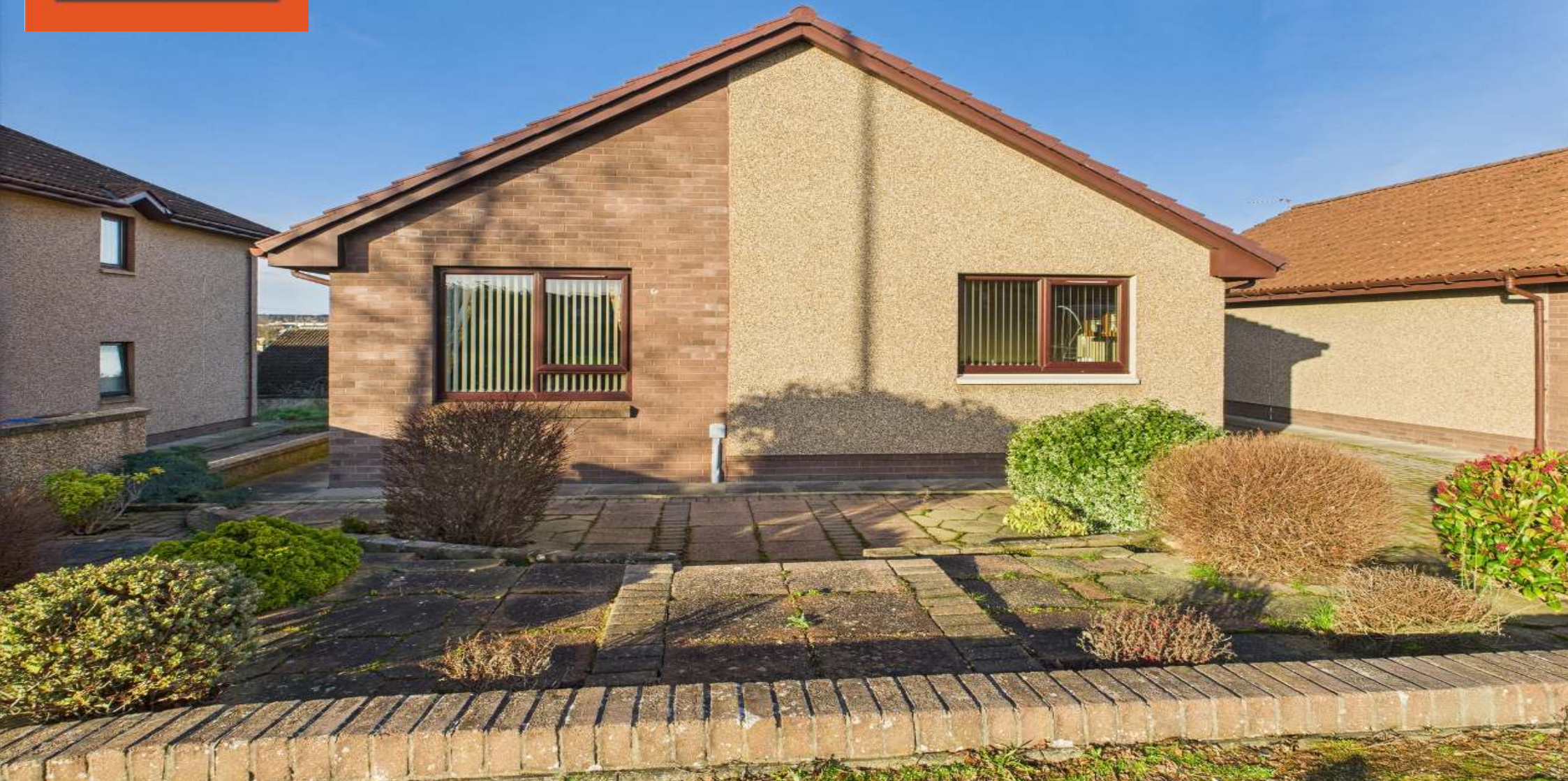
School Brae, New Elgin, Elgin, Moray