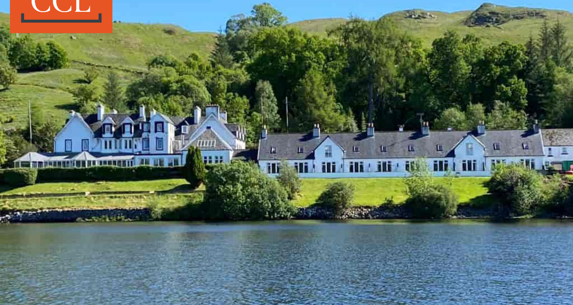
Portsonachan Hotel | Portsonachan | Dalmally | Argyll and Bute | PA33 1BJ