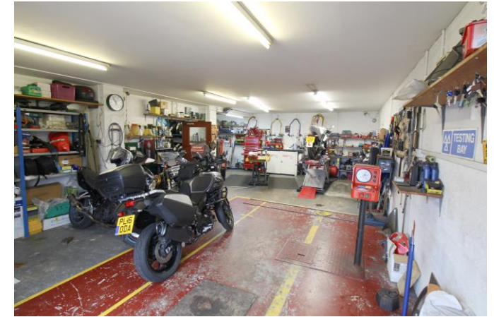
BASEMENT 2015 sq.ft. (187.2 sq.m.) approx.

Offers over £325,000 are sought for the business, fixtures, fittings, and goodwill. Stock in addition at valuation.