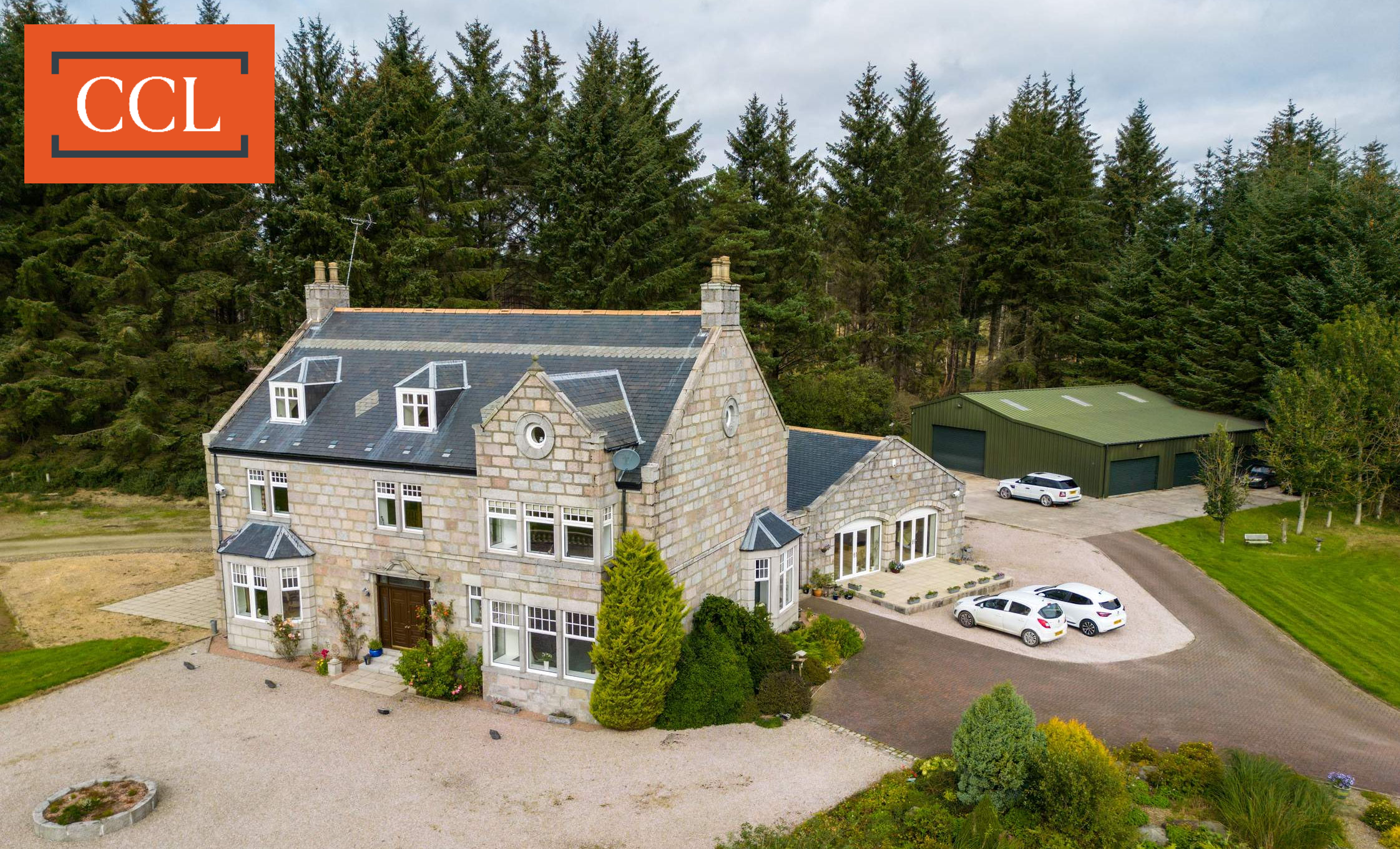
Canterbury House | Cornhill | Banff | Aberdeenshire | AB45 2BP