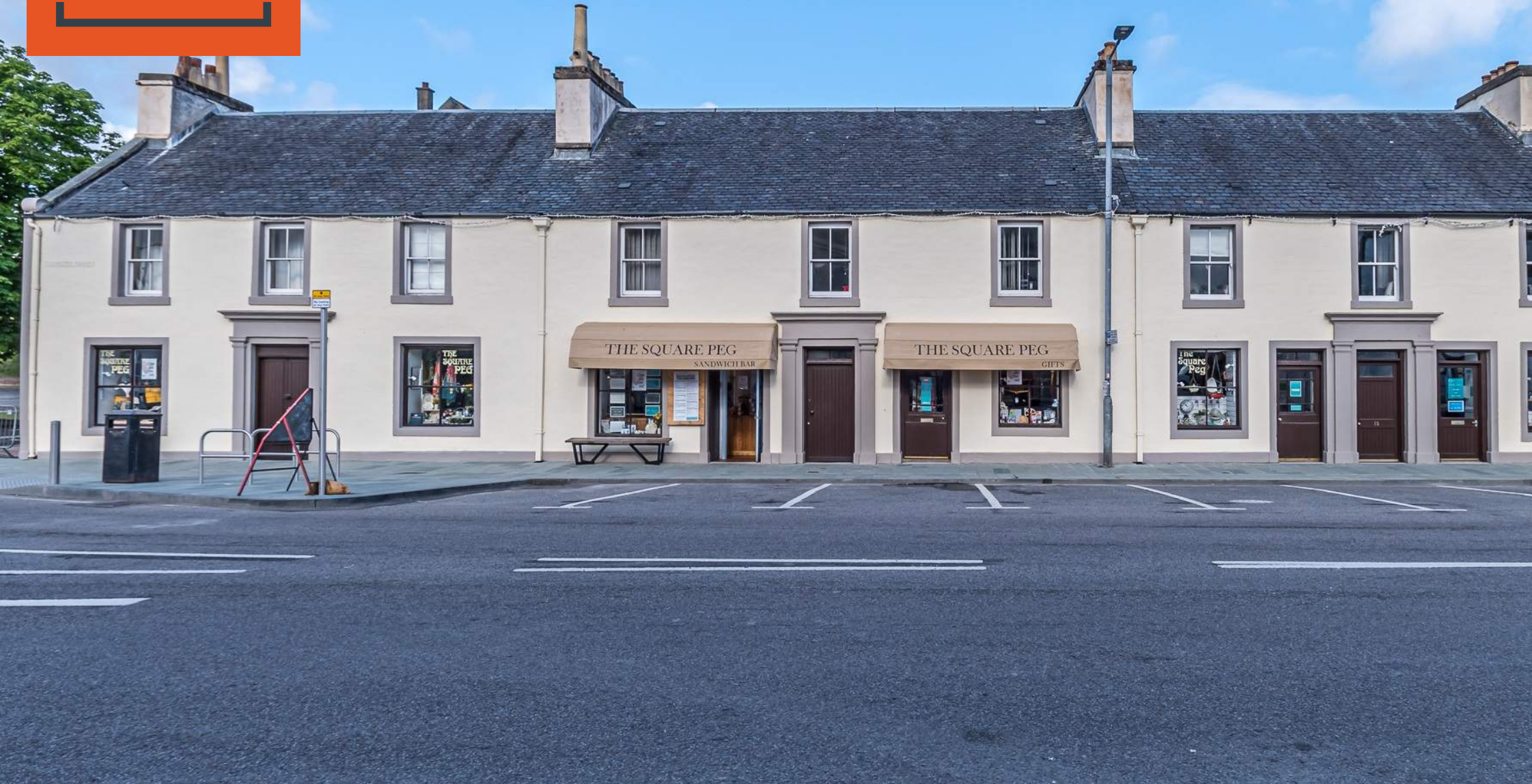
The Square Peg | Colchester Square | Lochgilphead | Argyll and Bute | PA31 8LH