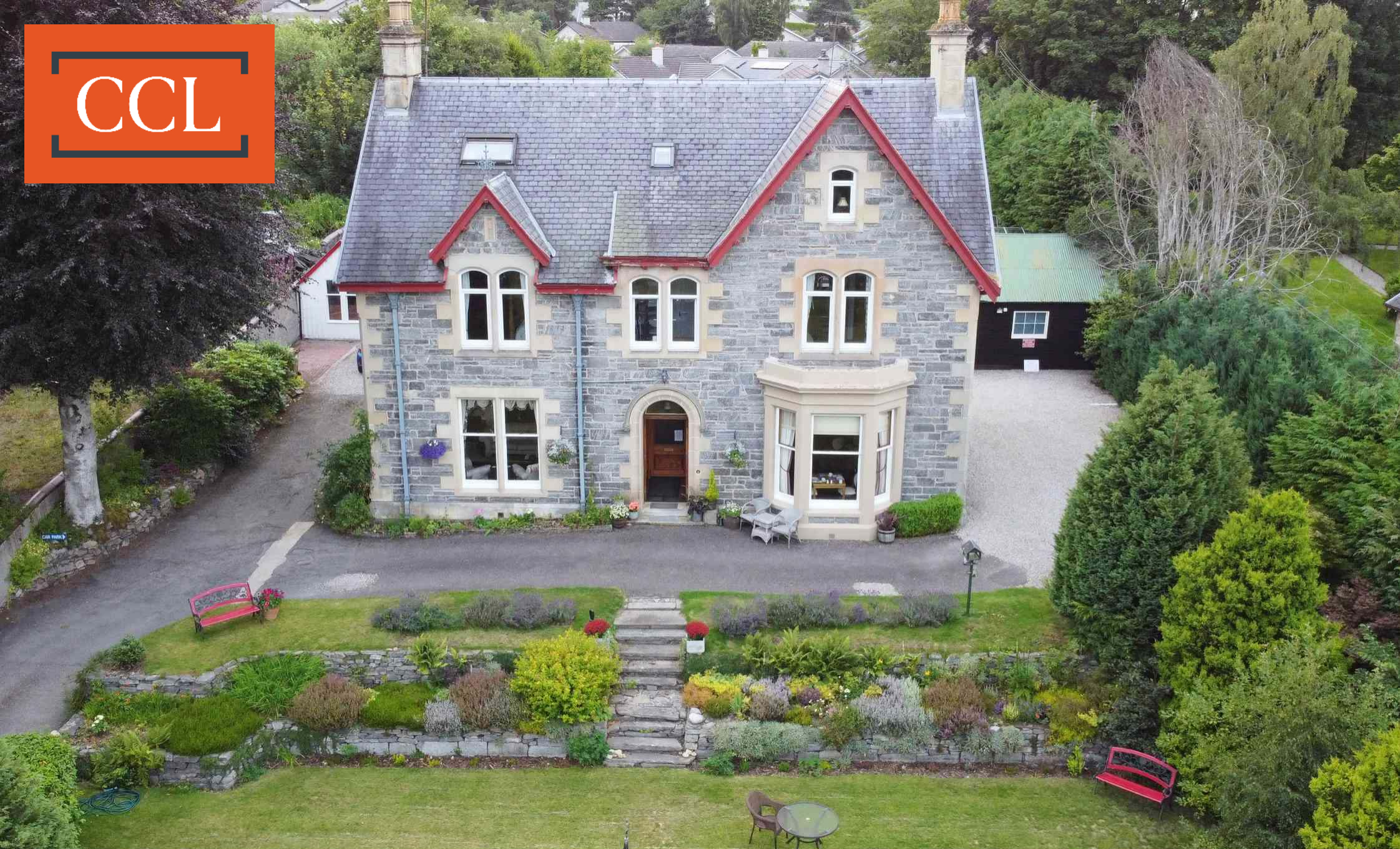
Rossmor Guest House | Woodlands Terrace | Grantown-on-Spey | Highland | PH26 3JU www.cclproperty.com