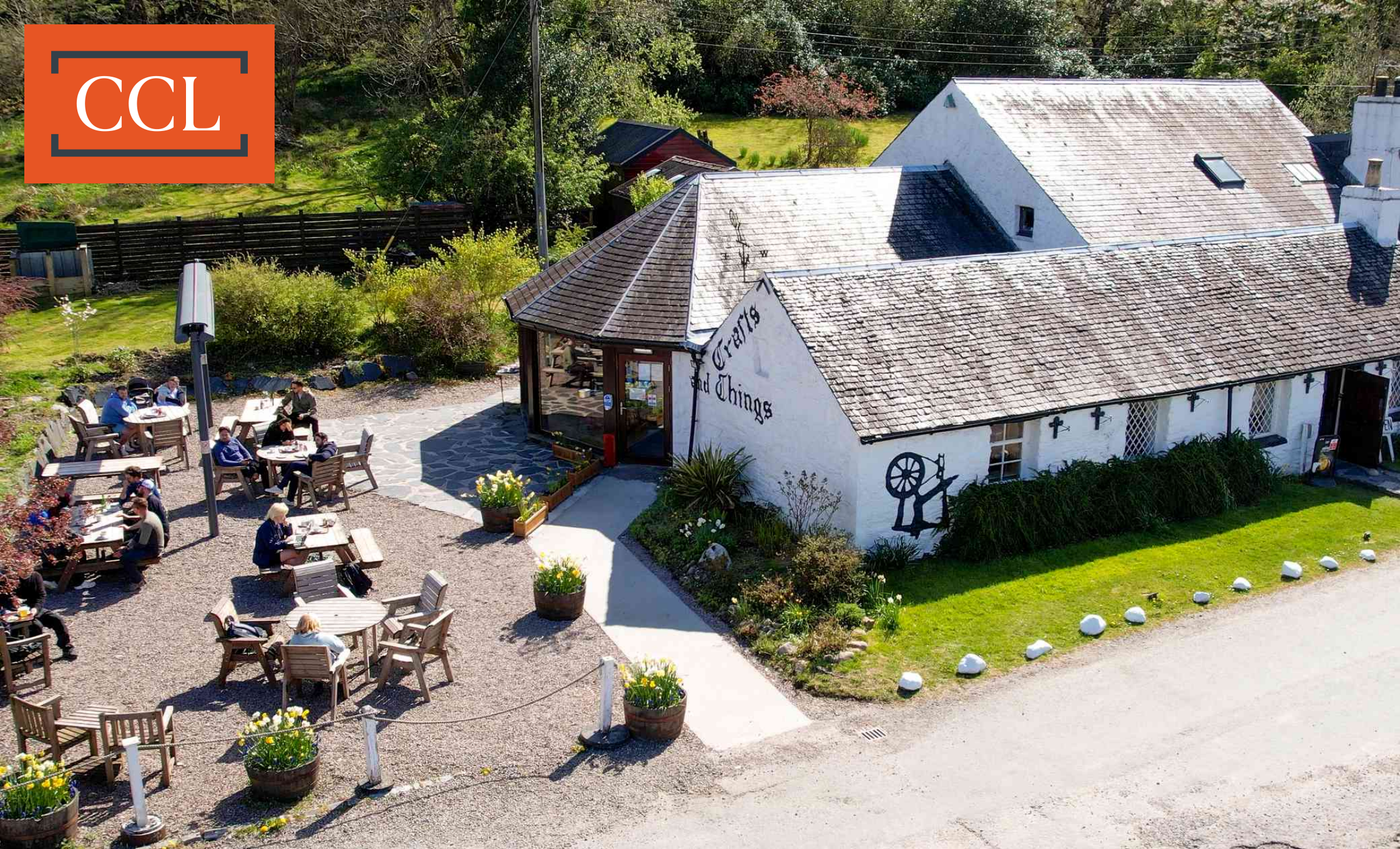
Crafts & Things | Tigh A Phuirt | Glencoe | Ballachulish | Highland | PH49 4HN